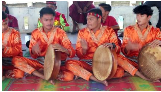
Figure 2. The Fashion of Rapa'i Geurimpheng Player