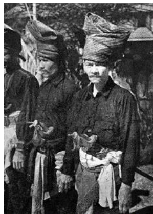
Figure 3. Ancient Acehnese Noble clothing

"The time shift makes the color of fashion has not been a concern of rapa'i geurimpheng trainers in ukee village. Color selection is only based on taste when designing the color of the clothing used, in certain parts of the clothing used there is ethnic embroidery that there is the front (on the chest) and arms. Pants that are the same color as clothes with embroidered ornaments on the left and right legs. Equipped with a sarong cloth that has been modified to facilitate its use during the show. " This dress shows the modesty and gallantry of men when in public places, initially Acehnese men use clothes like those contained in the picture, especially the men who come from the kingdom. As in the following picture: