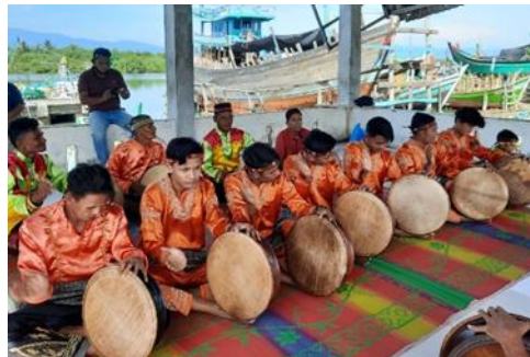
Figure 4. Sitting Position of Rapa'i Geurimpheng Player