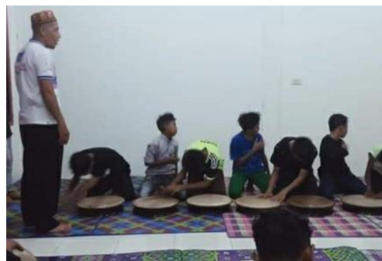
Figure 6. Uniformizing Responsibility

Trainees are always carefully pursued and can perform rapa'i games following the agreed time. This shows that all participants must be serious about practicing to get maximum results when the next exercise. In-person, all exercise participants are given the task of improving skills at the next meeting in the next meeting one by one so that all participants have the same skills and it is easy for the coach to control them. As seen in the following image: