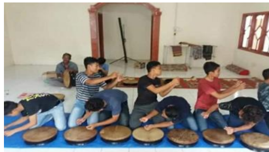
Figure 8. Inter-Religious Cooperation