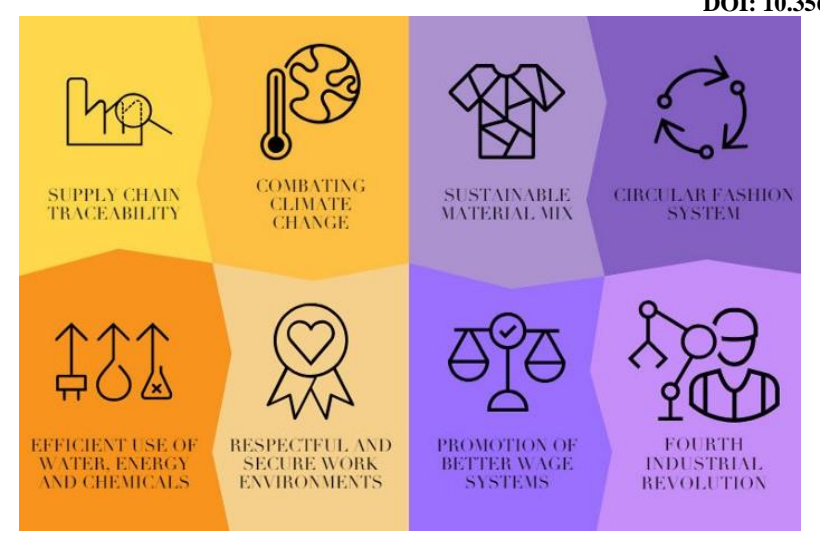
Figure 2: Fashion Industry Objectives