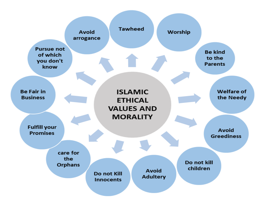
Figure 1: Shows the Major Points That Mentioned in The Verses Above