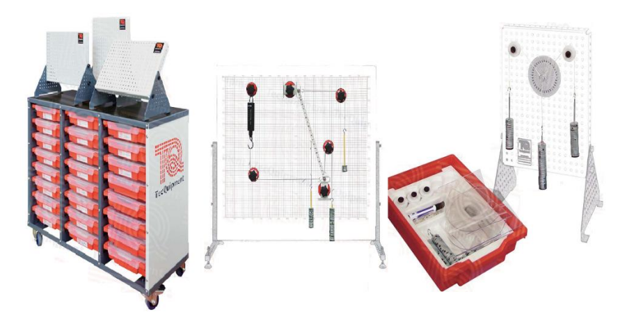
Figure 1. Mobile Trolley (Lab) With A Complete Set of Engineering Science Kit to Demonstrate the Most Important Concepts in Engineering Mechanics Such as Equilibrium of Rigid Body, Equilibrium of Forces, Etc. at the Classroom.