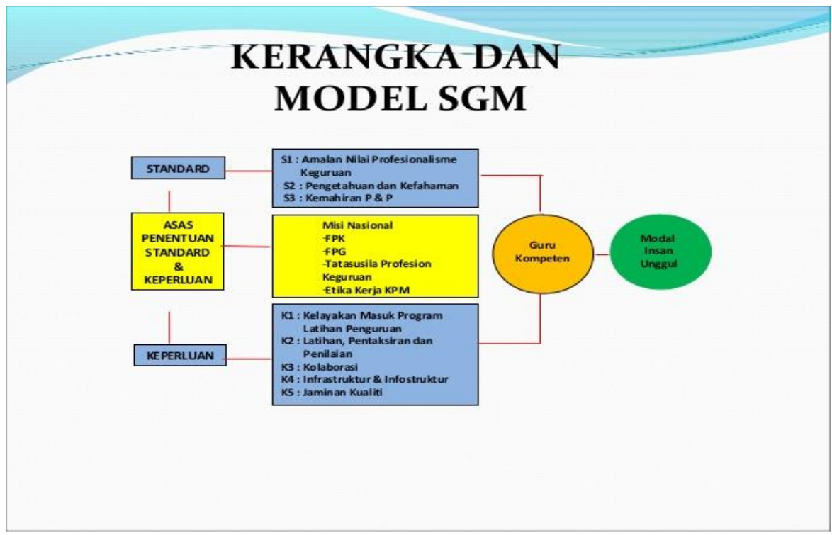
Figure 1: MTS Framework

SGM , that was introduced in 2009, is a guideline of professional competency of teacher that needs to be achieved by every teacher in Malaysia. SGM contains three standards, namely Standard 1 practice of teacher professionalism value, Standard 2 knowledge and understanding, and Standard 3 teaching and learning skills (PdP).