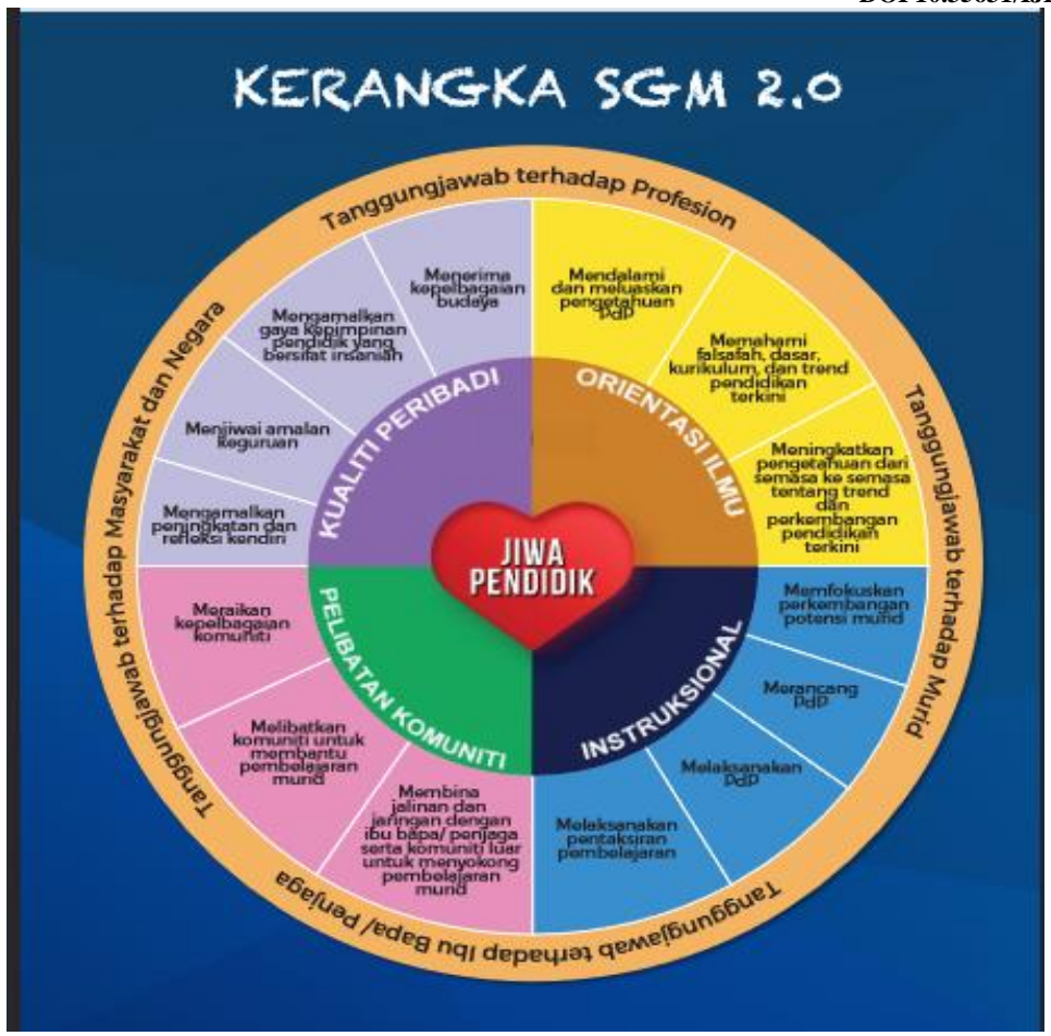
Figure 2: Standard Guru Malaysia (SGM2.0)