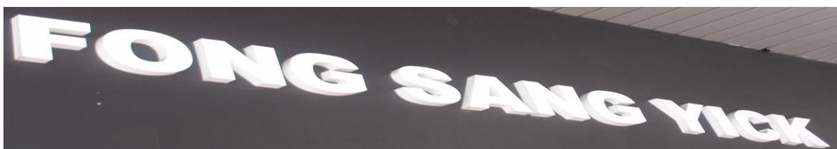
Figure 4: Monolingual Company Name In Neither Malay Language Nor English

As a multilingual society, many languages were used by the businessmen in Labuan to name their companies besides the national language – Malay language and the second language – English.