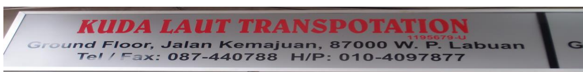
Figure 9: Company Name With Error Of ‘Transportation’

As shown in Figure 8 and Figure 9, both companies sign boards employ the lexis of ‘transpotation’ with a spelling error. These sign boards are put up at the same location to indicate that the same type of service i.e. transportation is provided.