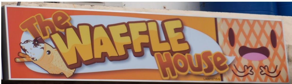
Figure 2: Monolingual Company Name In English

The business owner of the above company has chosen pure English to name his company because ‘waffle’ is explicitly representing the product they are selling - waffle the ‘imported’ food, instead of wafle in Malay language.