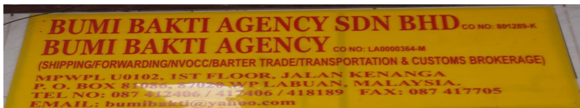
Figure 6: Code-Mixing Of Malay Language And English Company Name

Figure 6 shows a company name using the code-mix of Malay language and English. ‘BUMI’, ‘BAKTI’, ‘SDN’ and ‘BHD’ are lexis of Malay language whereas ‘AGENCY’ is an