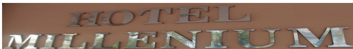
Figure 10: Company Name With Error Of ‘Millennium’