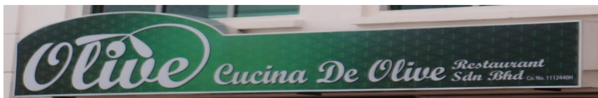
Figure 7: Code-Mixing Of Malay Language, English And Other Language

The above company name shows the company owner has chosen the English lexis of ‘agency’ instead of ‘agensi’ in order to name the company in monolingual Malay language. The language choice of the above company name shows the consequence of language contact between Malay language and English.