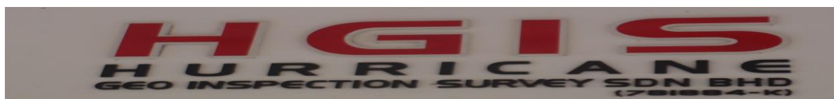
Figure 5: Code-Mixing Of English And Malay Language Company Name

The above company name in Figure 5 shows the business owner chooses English as the ‘dominant’ language and Malay language as the ‘minor’ language in naming his company. ‘Hurricane’, ‘Geo’, ‘Inspection’ and ‘Survey’ are English lexis.