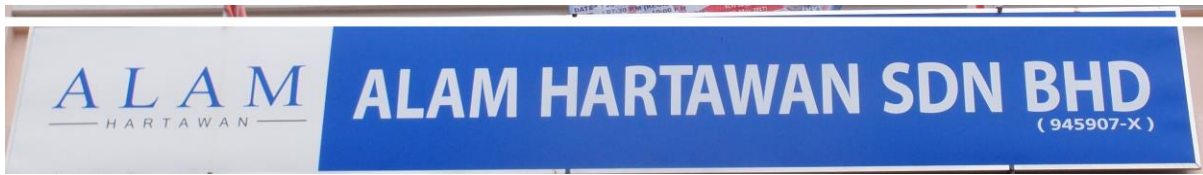
Figure 3: Monolingual Company Name In Malay Language

The above company name is purely presented in Malay language. ‘Alam Hartanawan’ or literally means ‘Property World’. The company name used a short form of Sdn Bhd instead of Sendirian Berhad .