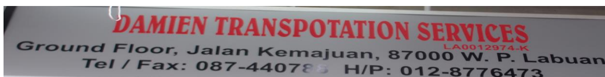
Figure 8: Company Name With Error Of ‘Transportation’