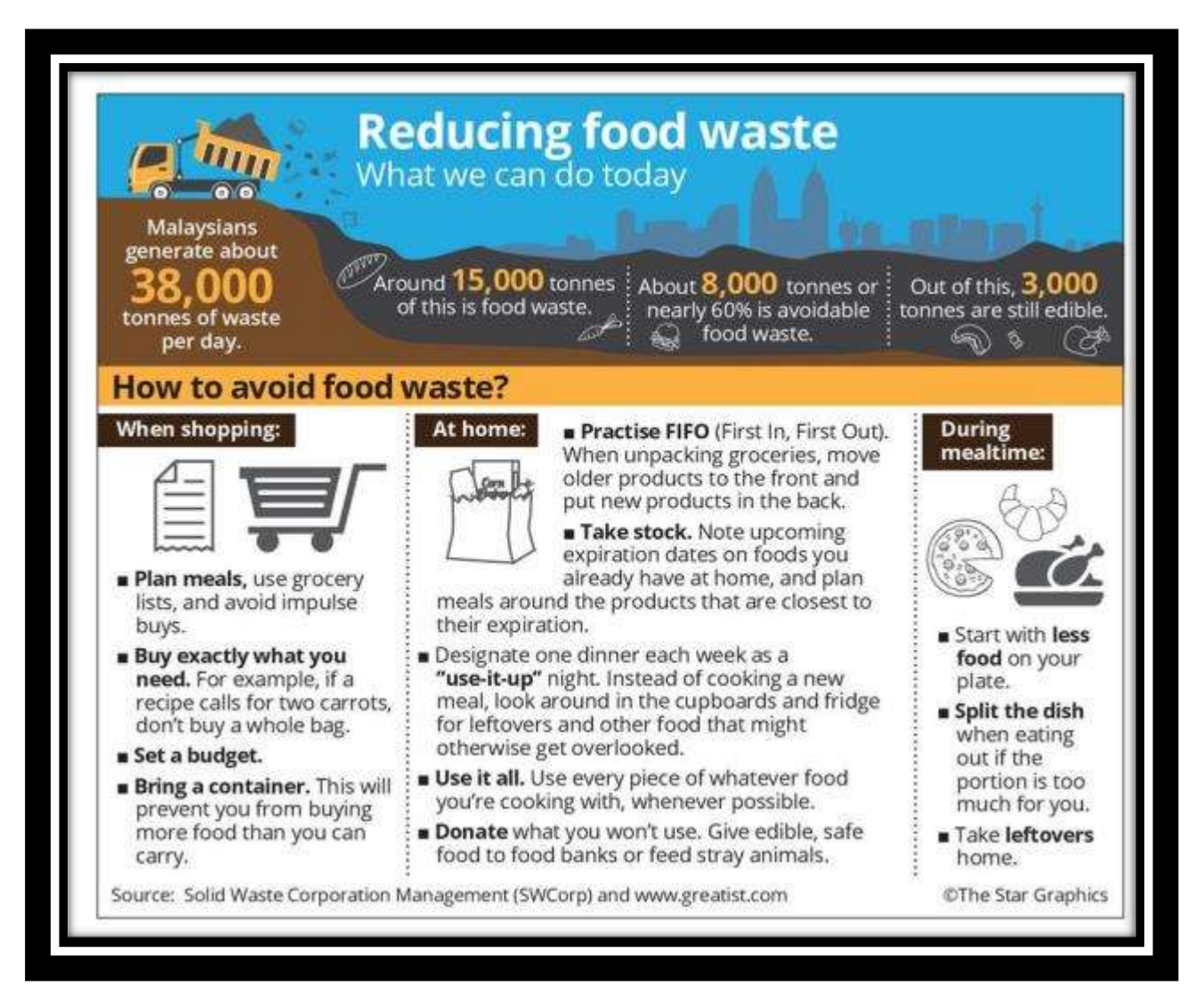
Figure 4: A concept of 3R by MYSave Food Network (source: SWCorp)

reducing food loss and food waste and advocating the voluntary approach through awareness, persuasion and education, appealing to public and stakeholders in the food and beverages industry (Malaysia Kini 2016).