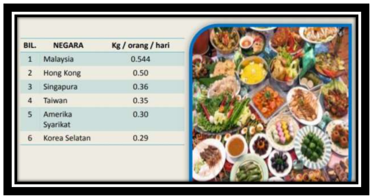
Figure 2: A statistic by SWCorp Malaysia in showing the comparison of food waste by countries.

Malaysia alone, the statistics shows said that we are losing 28.5% from the harvested rice costs of RM918 million. Meanwhile, we are losing about 20%-50% of harvested fruits and vegetables during the process of food management.