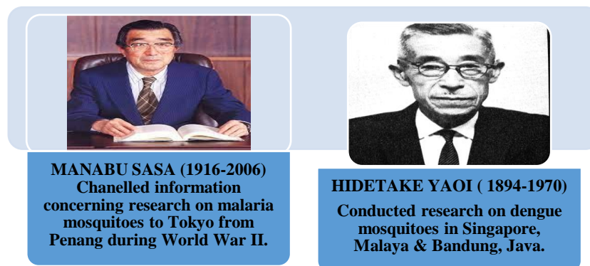
Figure 3: Mosquito Research Conducted by Other Japanese Scientists Elsewhere in Malaya and Southeast Asia