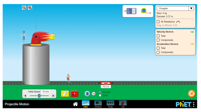
Figure 1: Screenshot of the Projectile Motion Experiment

The physics modules contained two experiments, Projectile Motion and Circuit Construction. Both VLs were developed by the PhET Project (Wieman and Perkins, 2006). In the Projectile Motion experiment (Figure 1), students were allowed to shoot a variety of objects such as a pumpkin, cannonball, golf ball, football and many more from an adjustable height and distance. This module allows students to explore the concept of projectile and ballistics. The experiment will show that the mass of the object does not contribute to the projectile as long as it has the same initial velocity. In UPM Foundation Program, the students learned about projectile motion in the second chapter of subject Physics I and performed the corresponding physical experiment in the laboratory. Meanwhile, the Circuit Construction module is used to let students design and test different electrical circuit setups according to the instructions given.