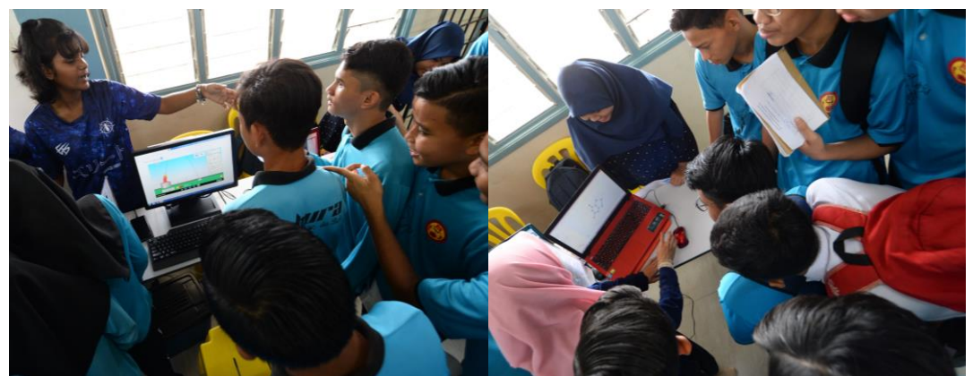
Figure 4: a(left) Projectile Motion Experiment and b(right) Building 3D Molecule at PSM 2019.

Since AsperLabs is practically a website, it can be accessed from anywhere with an internet connection. After the successful implementation of VLs for the physics and chemistry subjects, AsperLabs were brought outside UPM to be included in PASP UPM annual STEM program known as Program Pintar Sains dan Matematik (PSM) 2019. This program was organized by PASP UPM and Sekolah Menengah Kebangsaan (SMK) Taman Bunga Raya 1, Rawang, Selangor with the cooperation from the Hulu Selangor district education office. The main objective of the program is to increase the awareness of science towards students in the rural area, with the aim to increase the number of students pursuing science as their educational choice and career path. The program was held on 21<sup>st</sup> October 2019. A total of 158 students (71 male and 87 female) attended the program, focusing on students taking the Form Three Assessment (PT3) in 2019. Twelve STEM activities were carried out with two of them were VLs. The students were allowed to carry out the Projectile Motion (Figure 4a) from AsperLabs and "Build a Caffeine Molecule" (Figure 4b) virtual experiments.