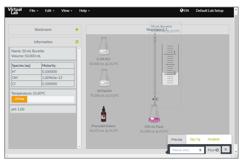
Figure 2: Screenshot of the Acid-Base Titration Experiment

structure of a protein-DNA complex (the lambda repressor-operator complex) and manipulate the structural representation of the protein and the DNA.