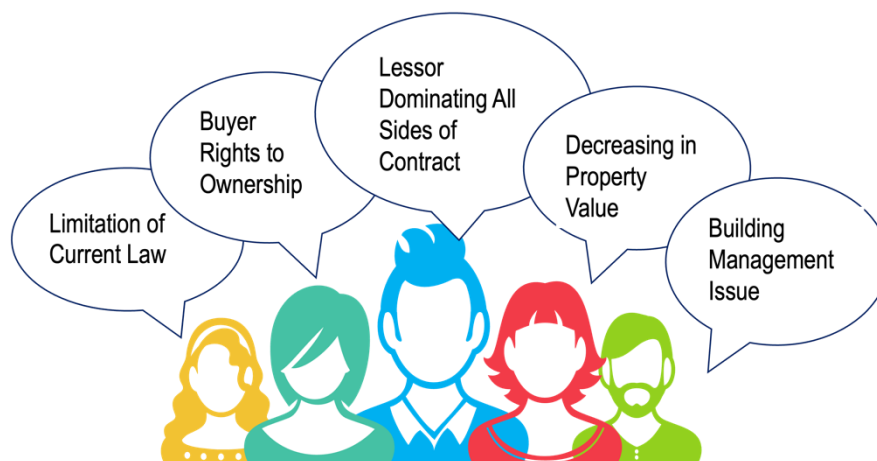
Figure 1: Five Major Issues in Strata Lease Scheme Development