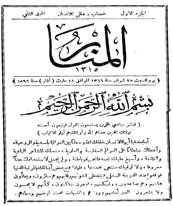
Figure 2: Al-Manār periodical