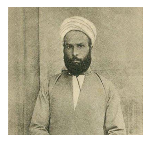
Figure 1: Muhammad 'Abduh