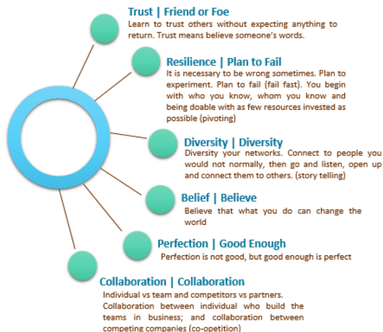
Figure 2: Personality Traits and Mindset According to BII