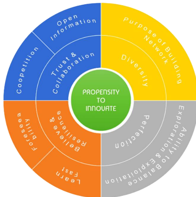
Figure 4: Personality Trait for Propensity to Innovate Model

Collaboration explains how founders collaborate with internal and external members. There are two types of collaboration shown in this variable, the collaboration that occurs between individuals and teams and on competitors and partners or called coopetition. Interestingly, all three informants agreed that they should collaborate with competitors except one, same with the question “do you have to compete with your competitors?”. It can be said that only two informant agreed that they should collaborate with competitors but also compete with them.