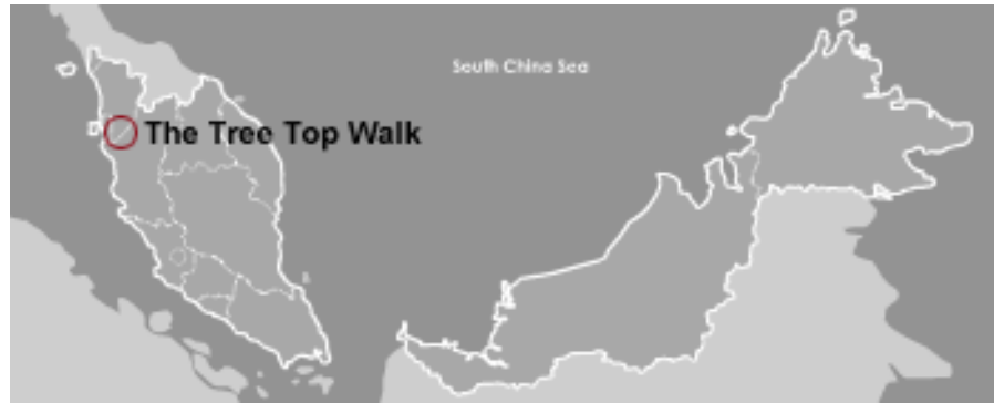
Figure 2: Map of Sungai Sedim Amenity Forest (Majlis Perbandaran Kulim, 2004)