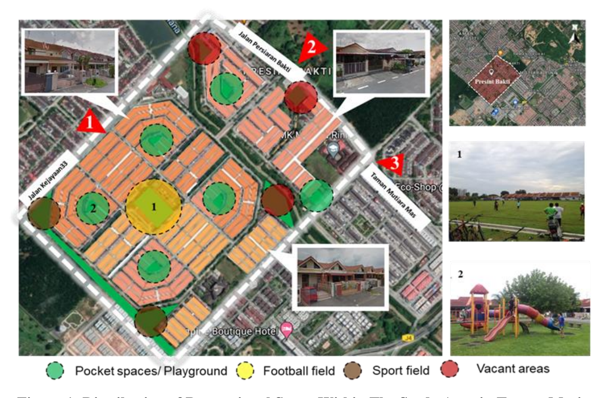
Figure 1: Distribution of Recreational Space Within The Study Area in Taman Mutiara Rini

and terrace houses and is not permitted to have more than three storeys of building height as shown in Figure (1).