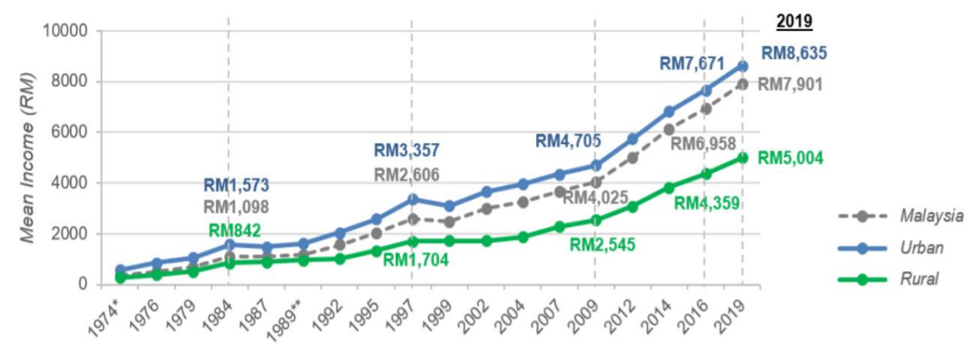
Figure 4: Mean Monthly Gross Income Household

The increase in the minimum wage is only RM1,200 compared to RM1,100 in 2019 (Belanjawan, 2020) while the estimated monthly budget for singles according to the Employees Provident Fund (2019) is at least RM1,870 which is not equivalent to the minimum wage set causing the quality of life of and well-being the population in Malaysia to decline. Based on Figure 4, income level in urban area in 2019 is mean RM 8,635 whereby in rural area is RM5,004. This shows that the average household income gap is high which is RM3,631 between rural compared to urban areas. furthermore, this matter also shows the well -being of the villagers is lower when compared to the urban population because based on Sacks (2010) richer individuals in each country are more satisfied with their lives or have better well-being than are poorer individuals.