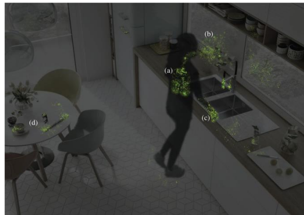
Figure 4: Conceptualization of Covid-19 deposition

Covid-19 had propelled authorities to restrict access to most public spaces and large areas, which could change the way they operate. Architects, planners, and built environment professionals are keen to examine many social and spatial implications to generate new patterns and configurations of use (Salama, 2020). Most architecture today shows evidence of how humans have responded to infectious diseases by redesigning our physical spaces to prevent Covid-19 deposition, as shown in Figure 4 below. Working from remote locations, learning online and shopping from e-commerce sites drives the focus on virtual access from smart devices (Goniewicz et al., 2020). Certain densely populated cities are vulnerable to the risk of infection (Chang, 2020). Working from home reduces physical contact but might pose a challenge for smaller and crowded houses without outside spaces (Saadat et al., 2020).