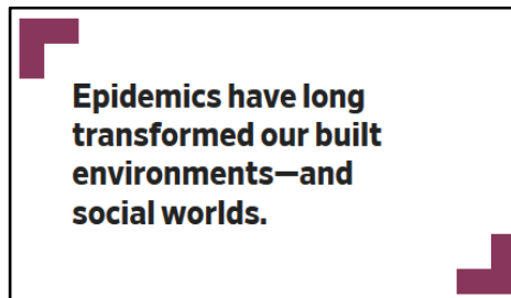
Figure 2: Statement on The Effect of Epidemics on Built Environments (Chang, 2020)